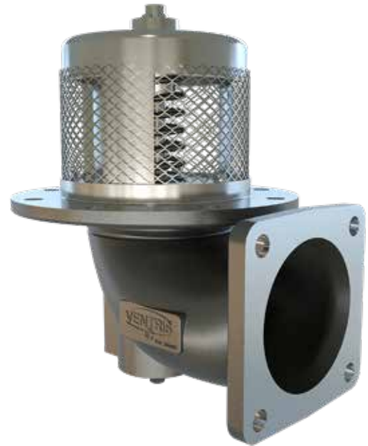
Ventris Internal Valve VEV100-1 (Square Flange Euro-100-1 Style)